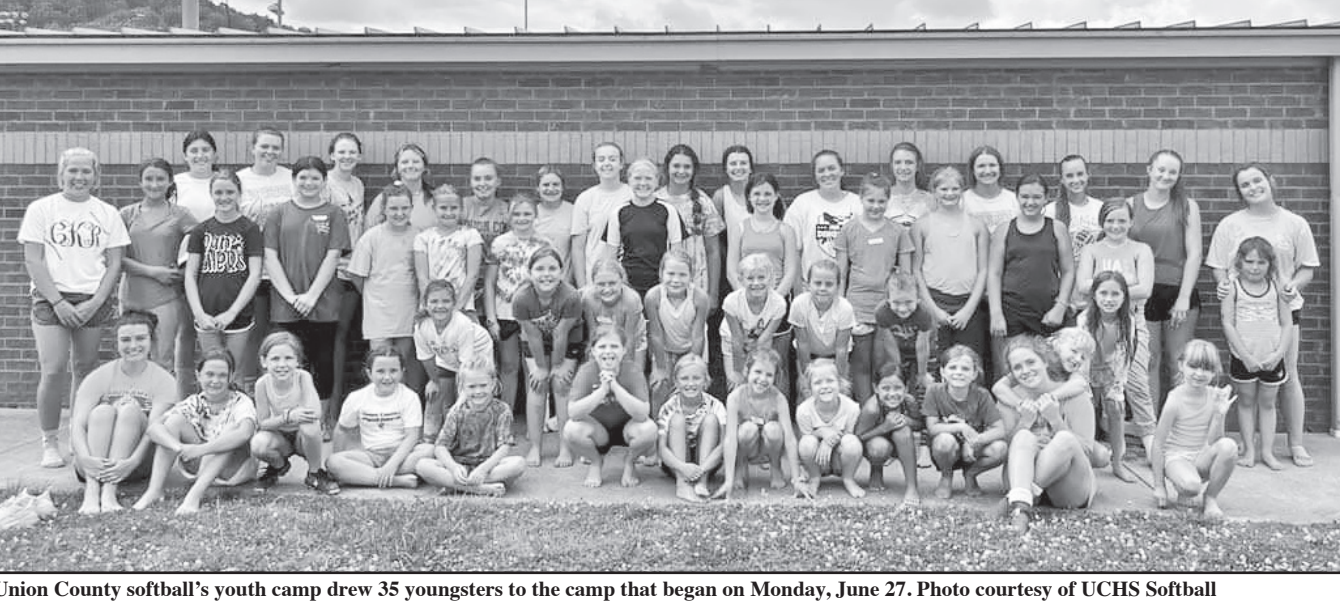
Union County softball's youth camp drew 35 youngsters to the camp that began on Monday, June 27.