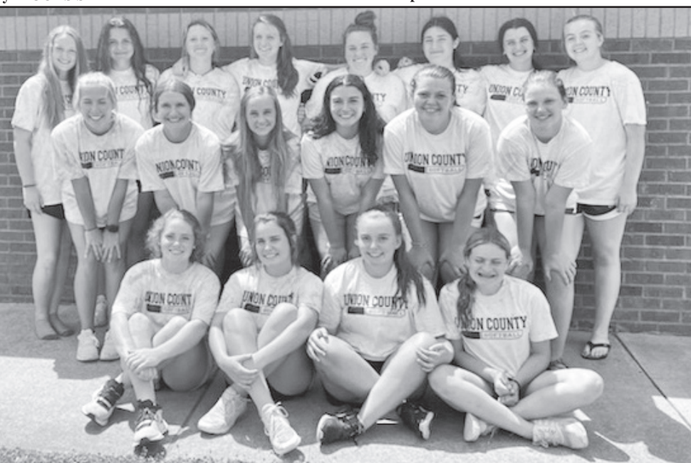
UCHS softball players helped out during the three-day youth camp.