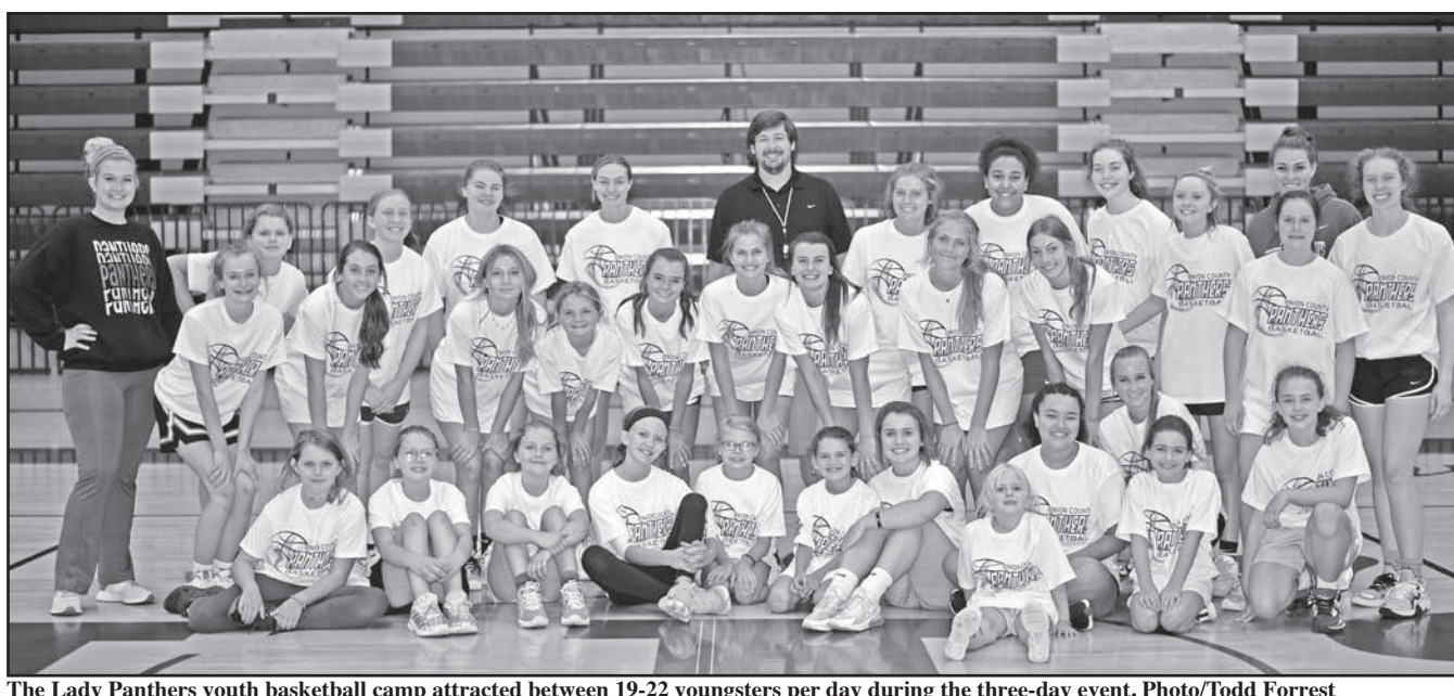
The Lady Panthers youth basketball camp attracted between 19-22 youngsters per day during the three-day event.